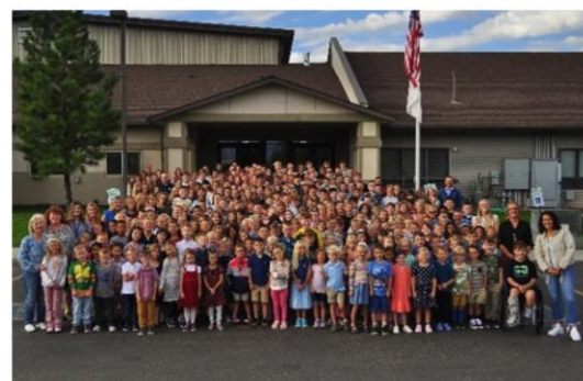
All School Picture taken Sept. 8th