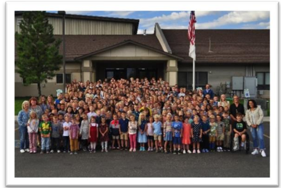
All School Picture taken Sept. 8th